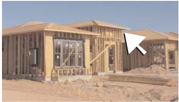
1-15 Bearing walls support the roof

A non-bearing wall means just that: a wall that does not bear or carry a structural weight, Photo 1-17 (right). It simply acts as a divider or screen to provide privacy or to keep out the weather. Non-bearing walls can be framed with lumber or built of brick, block, steel studs, or stone masonry. Floating walls also fall into the category of non-bearing walls.