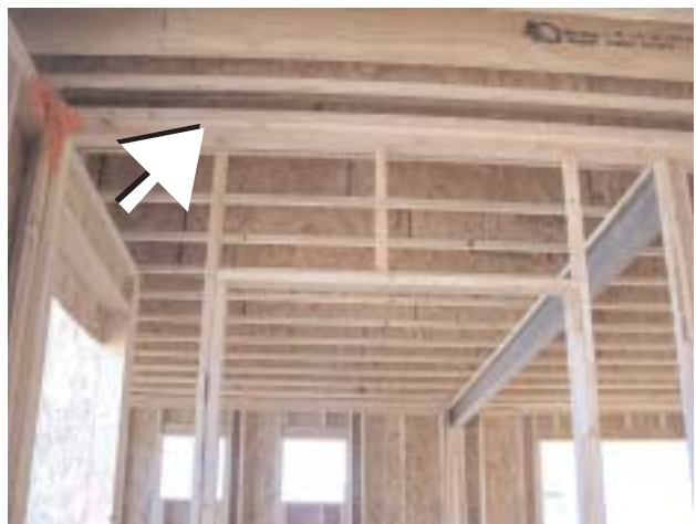
1-17 Non-load bearing wall (note that it does not support the ceiling)