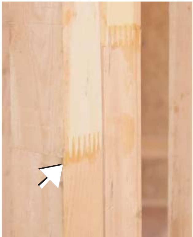
1-16 Finger jointed studs